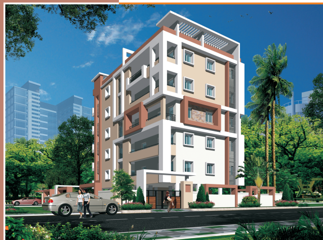
3 BEDROOM LUXURY APARTMENTS

SREE DURGA ESTATES Sri Sai Nivas, MIG 59, Ground Floor, 1st Lane, Dharma Reddy Colony, Phase - II, Hydernagar, Kukatpally, Hyderabad. Ph : 9550656565 E-mail : sree_durgaestates@yahoo.co.in