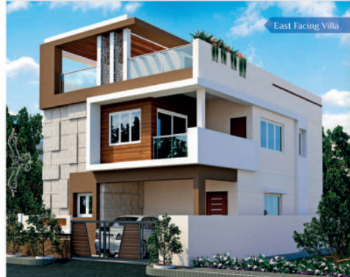
East Facing Villa