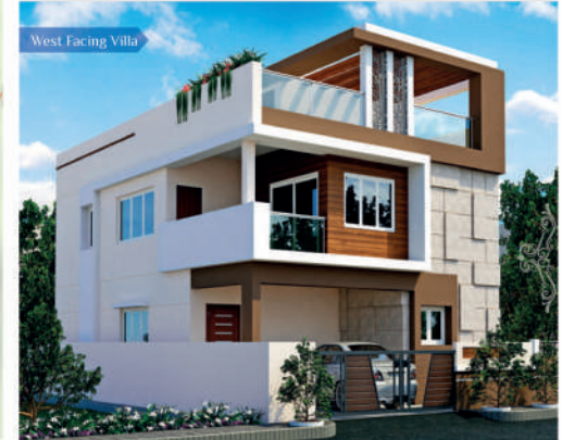
West Facing Villa