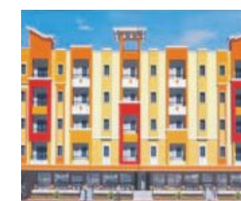
PARADISE APARTMENTS, BACHUPALLY, HYD