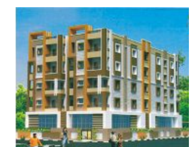
POORNA PRIDE, MIYAPUR, HYD