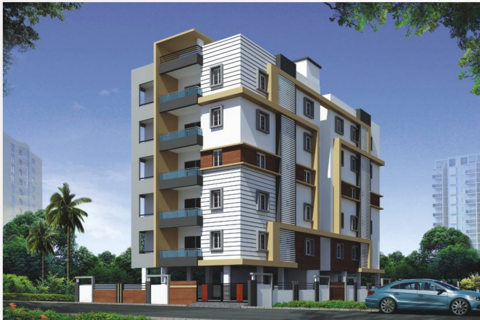
BLOCK - A