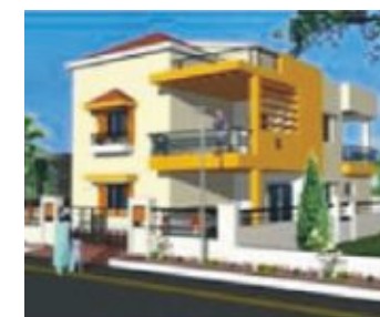
KVR PARADISE, BACHUPALLY, HYD