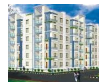
SS GRANDEUR, KPHB COLONY, HYD