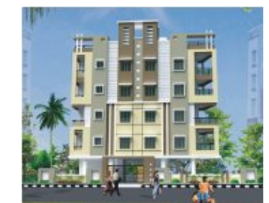
A4 LOUNGE, KONDAPUR, HYD