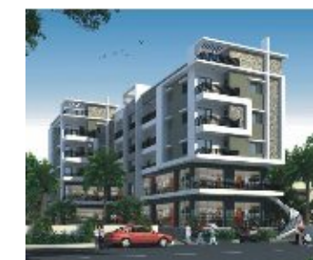
TSR CENTRAL, VJA