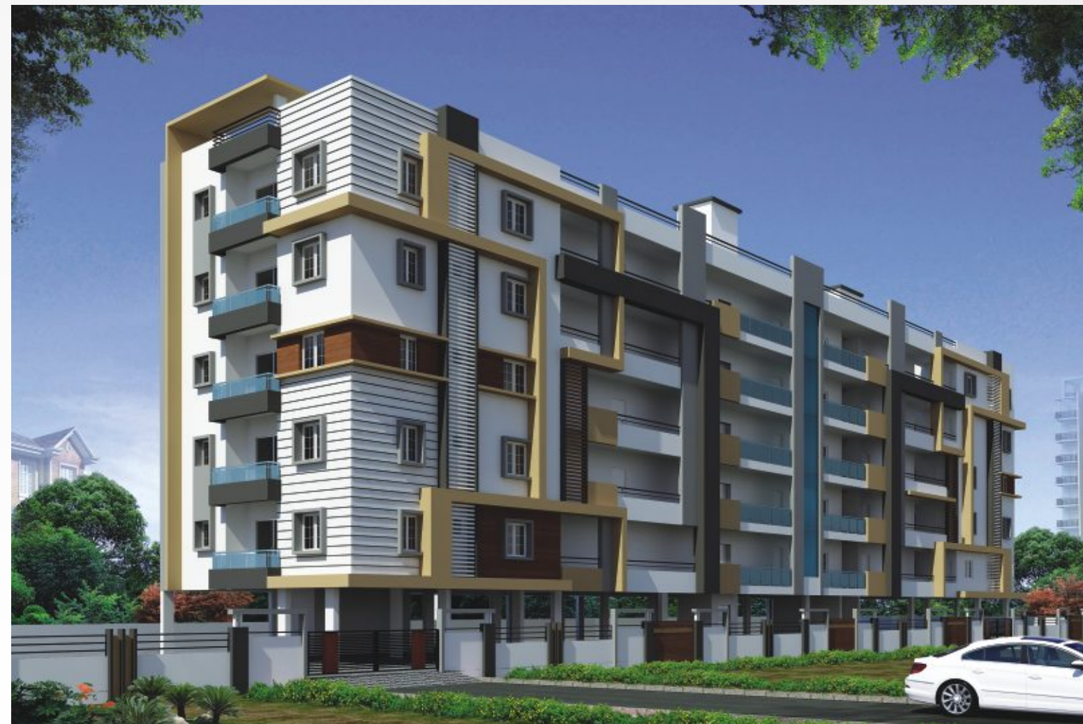
BLOCK - B