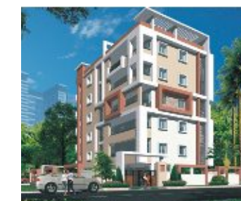
SAS CLASSIC, VJA