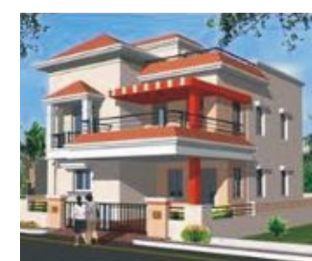
PVR MEADOWS, MALLAMPET, HYD